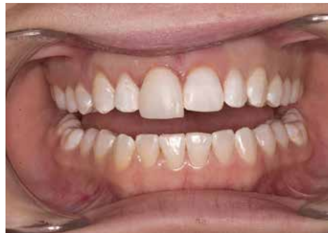
2. Initial layer of restorative resin (after curing, before contouring)