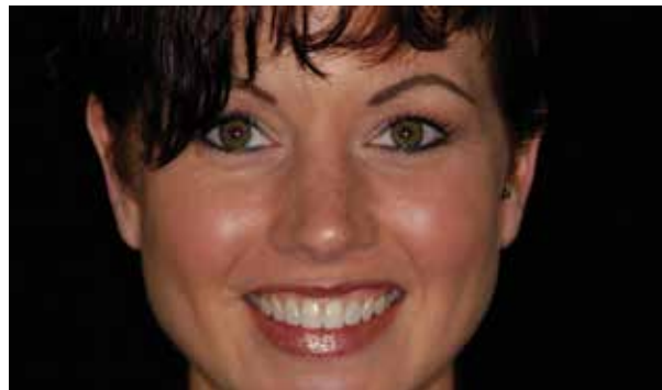
Excessive magnification for full face view