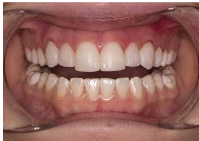
5. After contouring, but before polishing