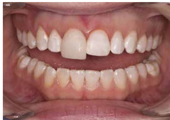
4. Final layer of resin (bulk layer, after curing, before contouring or finishing)