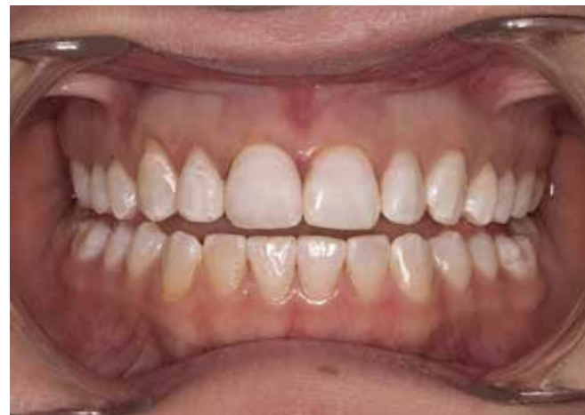
1. Initial preparation, beveling and/or abrasion of tooth surfaces