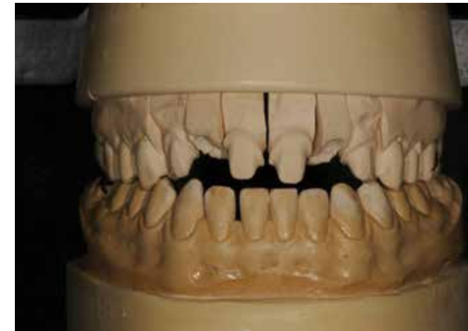
1. Frontal view of prep model in occlusion with opposing model

These photos are to be taken at 1:2 (1:3) magnification or digital equivalent