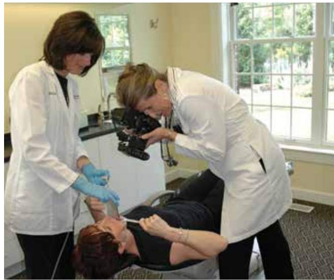
Occlusal views are aided by having patient reclined and holding retractors. An assistant holds an occlusal mirror against opposite arch and keeps mirror from fogging with a gentle stream of dry air. Photographer stands above the patient to capture the maxillary view and below the patient's head to capture the mandibular view.