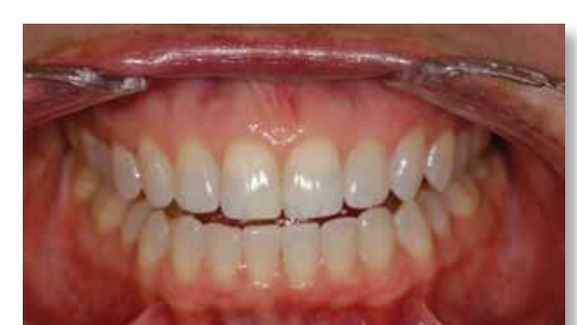
Lack of focus - image blurry