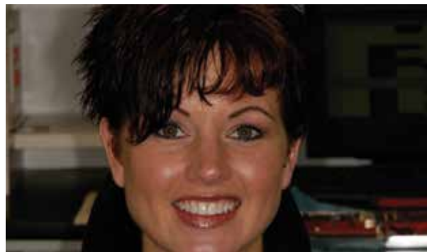
Full face image taken without a uniform backdrop