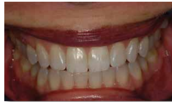
Inadequate retraction, superior angle and maxillary and mandibular teeth inadequately separated