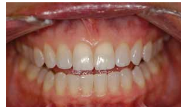
Anterior teeth are in focus but posterior teeth are out of focus. F-stop too low - improper depth of field