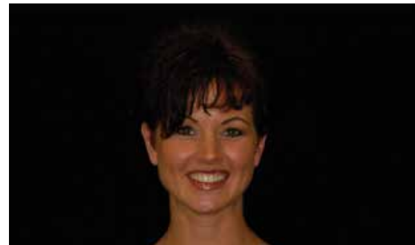
Inadequate magnification for full face view