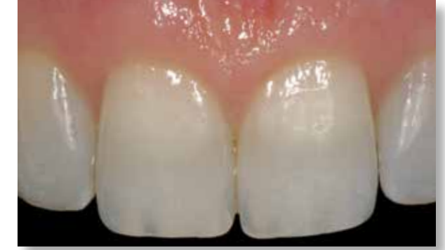
Excessive magnification for 1:1 (1:1.5) view