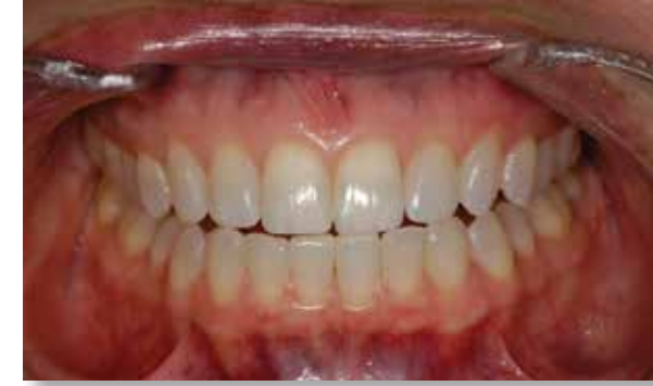
Teeth inadequately separated to highlight incisal edges