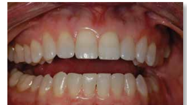
Image taken from an inferior angle and the patient's right