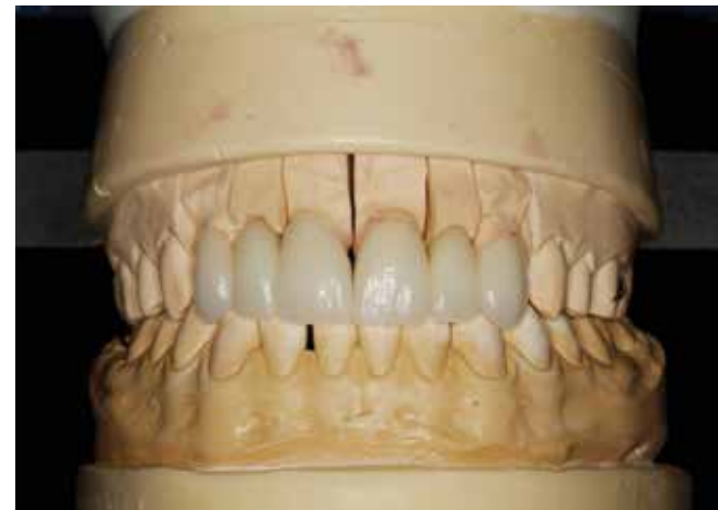
7. Frontal view of finished case on model