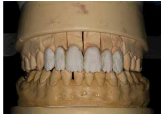
5. Frontal view of completed build-up before firing or processing