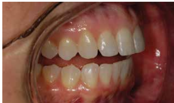
Improper angulation – lateral view should be exposed perpendicular to the lateral incisor