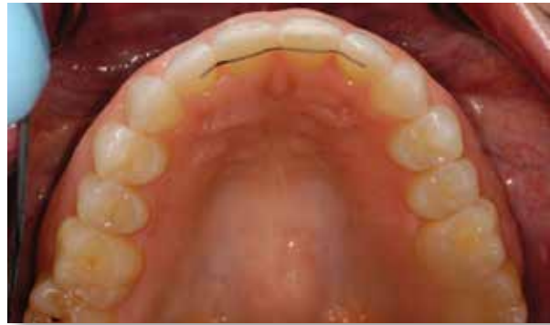
Unreflected teeth visible, fogging of mirror, debris visible in teeth