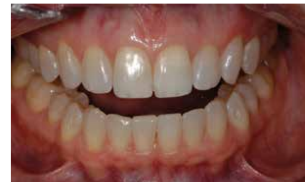
Image taken from a superior angle