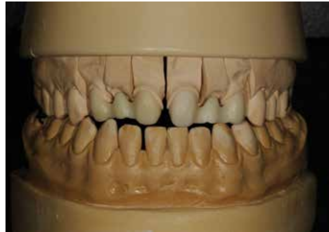
4. Frontal view of bridge framework or coping design before application of veneering material

These photos are to be taken at 1:2 (1:3) magnification or digital equivalent