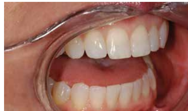
Improper framing and inadequate retraction