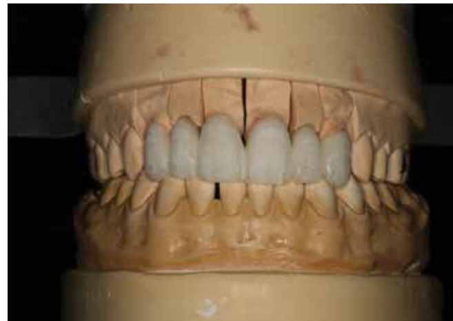
6. Frontal view of contoured bisque bake (show tissue adaptation on Case Type III)