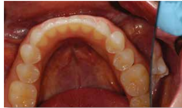
Improper framing – edge of mirror and unreflected teeth visible