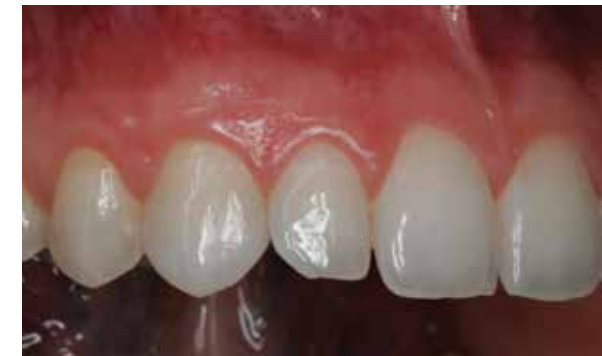
Correct framing without contrasting device