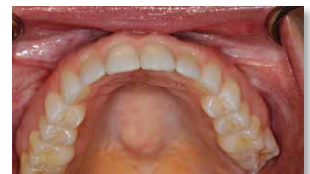
Improper angle - imaged taken from a facial perspective, without a mirror