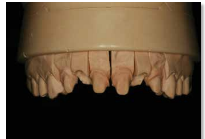
3. Frontal view of lab manipulated tissue site for Case Type III