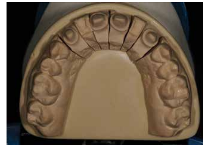
2. Occlusal view of prep model